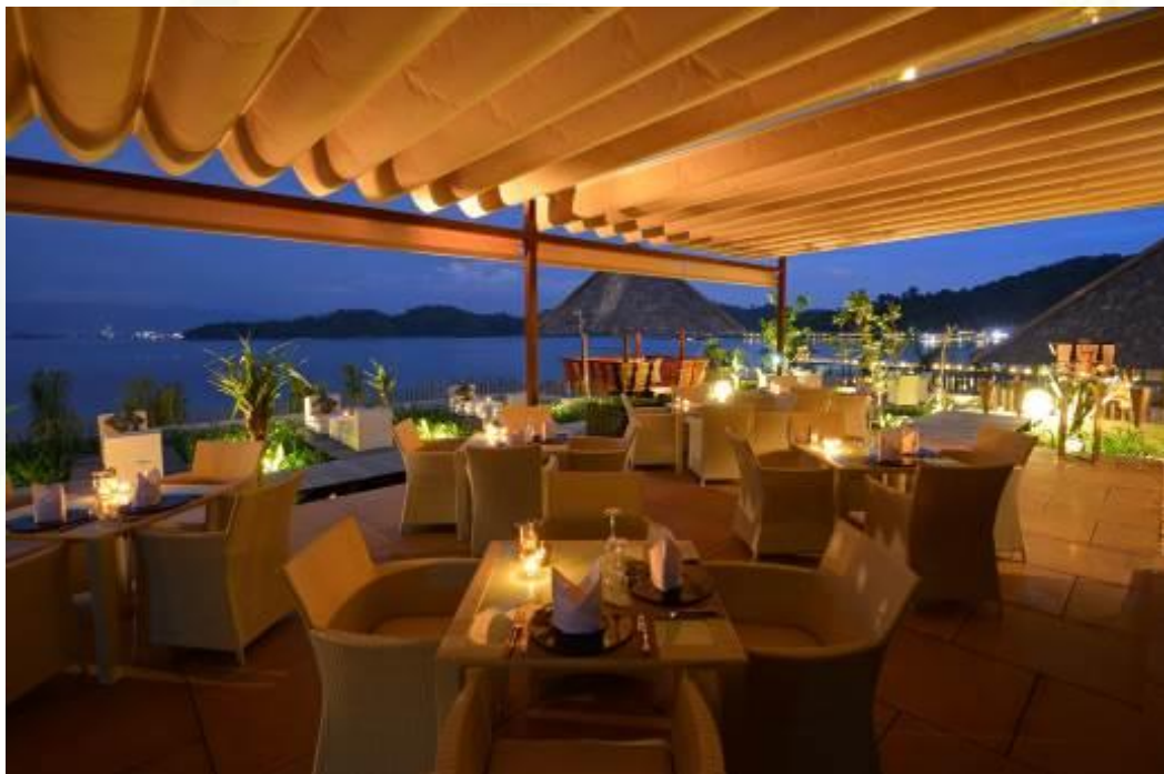
Fisherman's Cove Restaurant